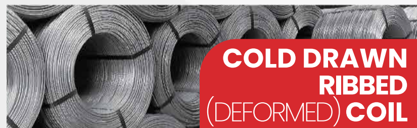
COLD DRAWN RIBBED (DEFORMED) COIL