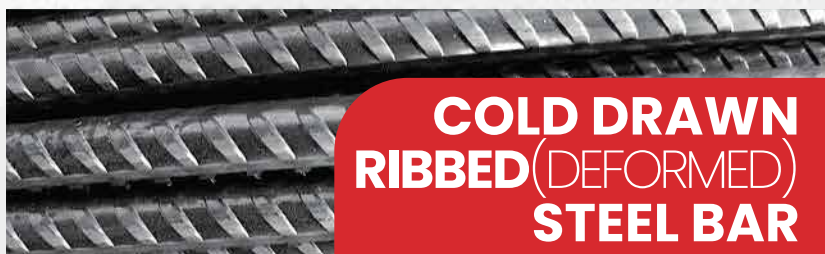
COLD DRAWN RIBBED (DEFORMED) STEEL BAR