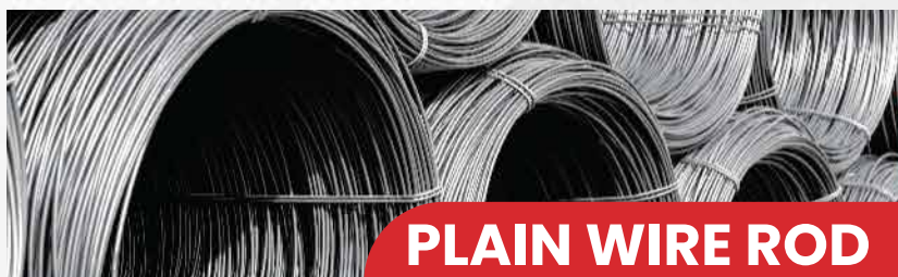
PLAIN WIRE ROD