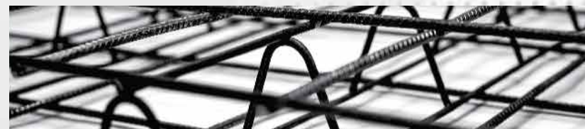
PROB REINFORCEMENT STAND